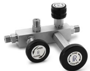
QSCM Stainless Steel Calibration Manifold 0 to 5,000 psi