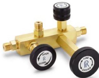
QTCM Brass Calibration Manifold 0 to 3,000 psi