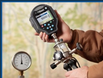
Gauges & Calibration References

Ralston Instruments provides complete pressure calibration solutions for a wide range of applications, saving time and taking the guesswork out of critical pressure testing, maintenance and repair operations.