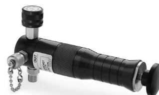
SP0V Gas Sampling Pump

A Fast, Convenient Tool for Taking Low Pressure Gas Samples