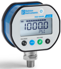
Field Gauge LC10