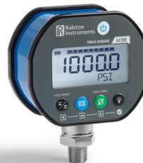
Field Gauge LC20