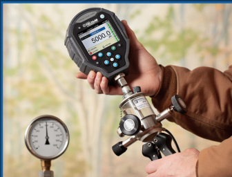
Gauges & Calibration References

Ralston Instruments provides complete pressure calibration solutions for a wide range of applications, saving time and taking the guesswork out of critical pressure testing, maintenance and repair operations.