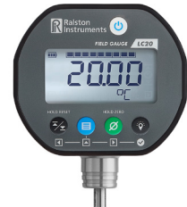
Field Gauge LC20-TA Digital Probe Thermometer

Ralston Instruments provides complete pressure calibration solutions for a wide range of applications, saving time and taking the guesswork out of critical pressure testing, maintenance and repair operations.