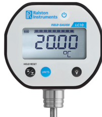
Field Gauge LC10-TA Digital Probe Thermometer